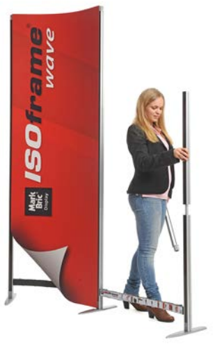
8 Follow the procedures shown above to build the new post to the height of the starter section. Add more modules as desired.