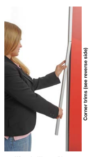
9 When the Wave wall is complete, finish each end by placing a set of 3 corner trims on the exposed magnets of the post.