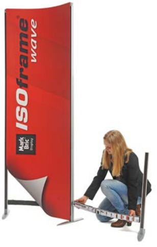
Now you can add an Extension Module onto the starter section just built. Create a foot+base post+Flexi-Link assembly as before, then insert the link into a base post of the starter module and press down into place.