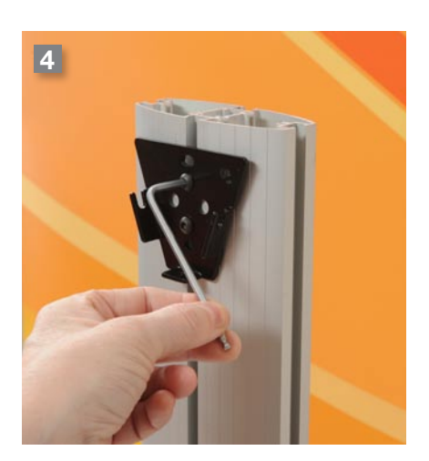
Lock the LCD holder with the screw.