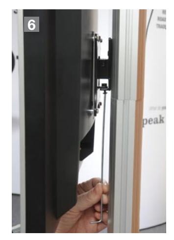
For extra security lock the LCD with the screw.