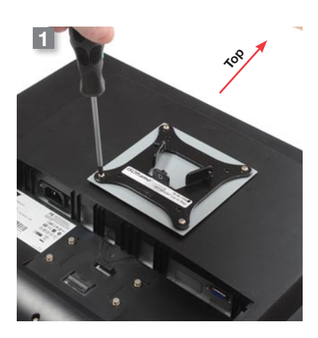
Attach the holder to the LCD