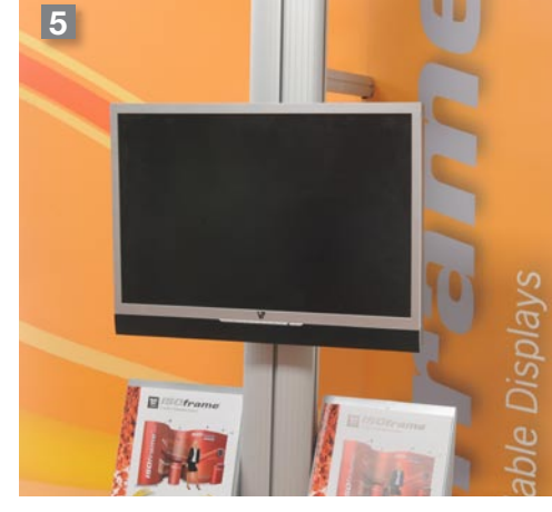
Hook on the LCD