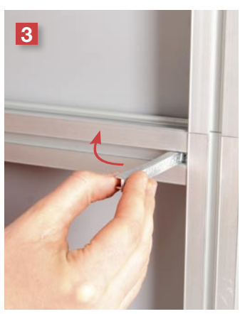
Lock beam with the FAST-clamp