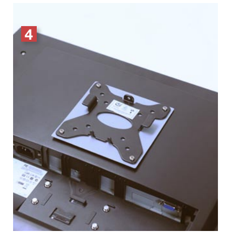
Attach the holder to the LCD