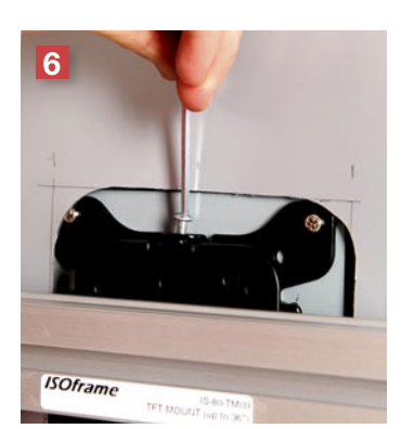
For extra security lock the LCD with the screw.