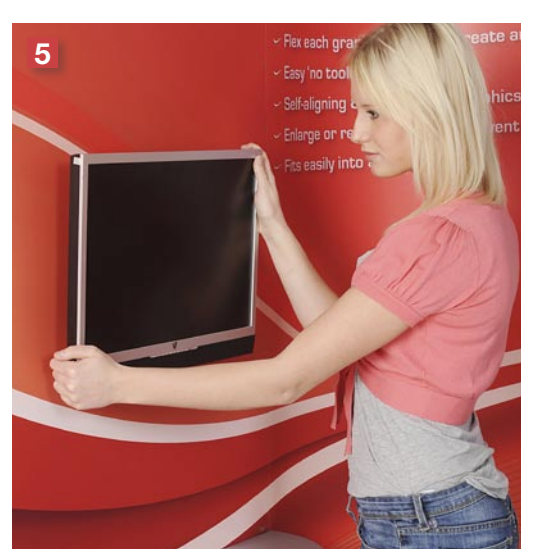
Hook on the LCD