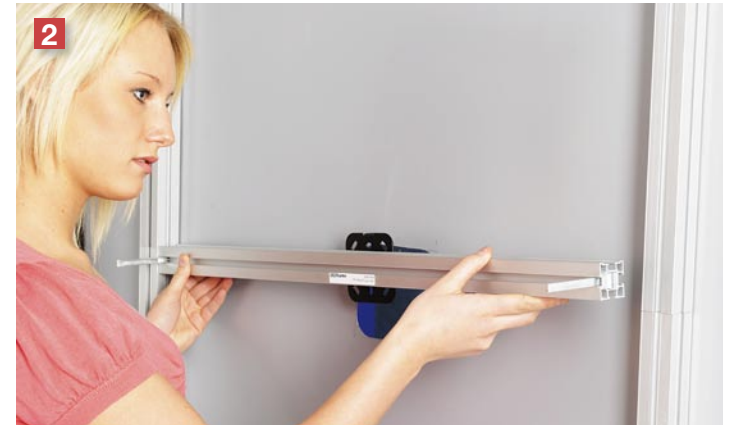
Attach the horizontal beam over the hole on the reverse side