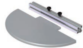
Extra Floating Shelf, item IS-9616