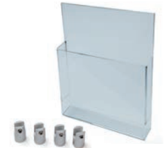
Literature holder Item IS-9318