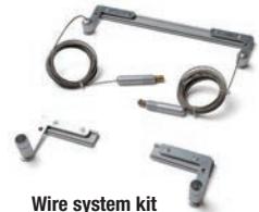
Wire system kit Item Midi IS-9312 / Maxi IS-9312